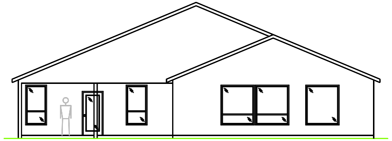
REAR ELEV. VIEW