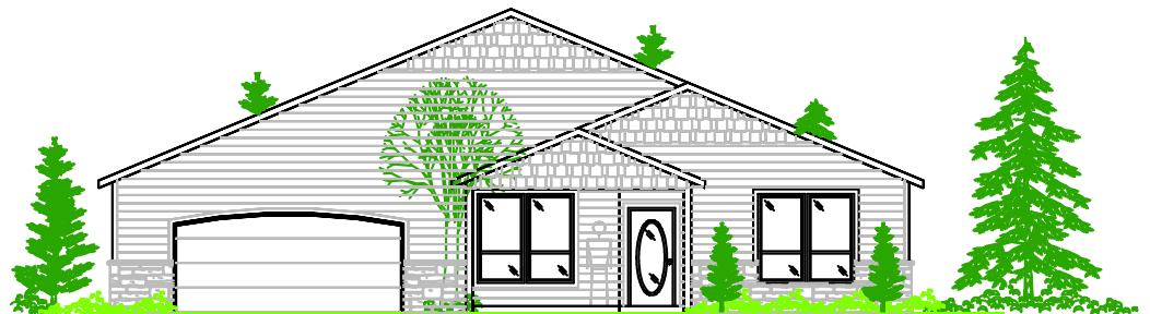
FRONT ELEV. VIEW

BRABEC DRAFTING SERVICE VANCOUVER, WA (360) 892-9502