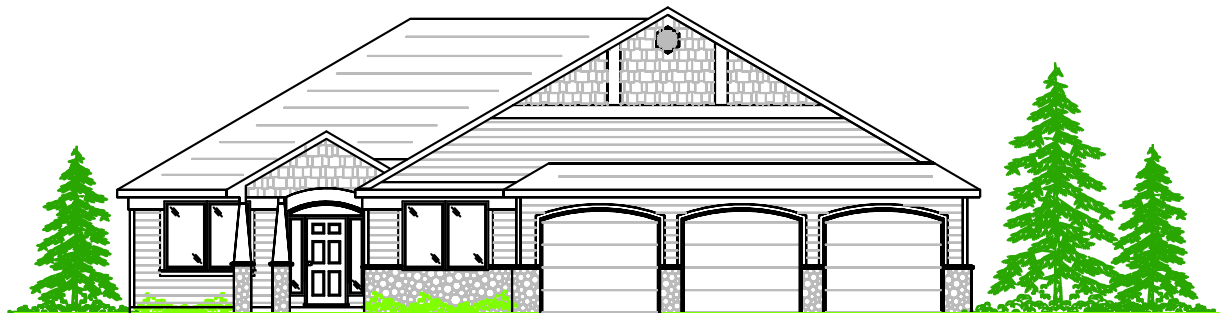
FRONT ELEV. VIEW

BRABEC DRAFTING SERVICE VANCOUVER, WA (360) 892-9502