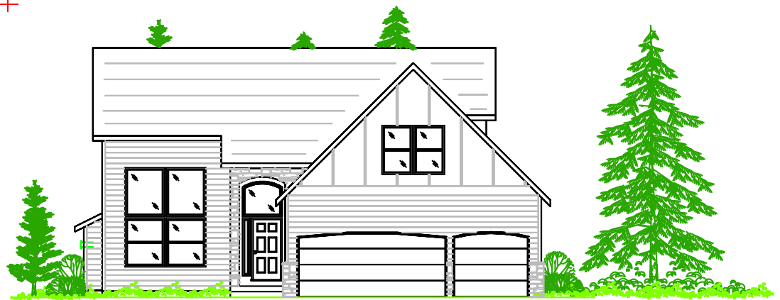
FRONT ELEV. VIEW

BRABEC DRAFTING SERVICE VANCOUVER, WA (360) 892-9502