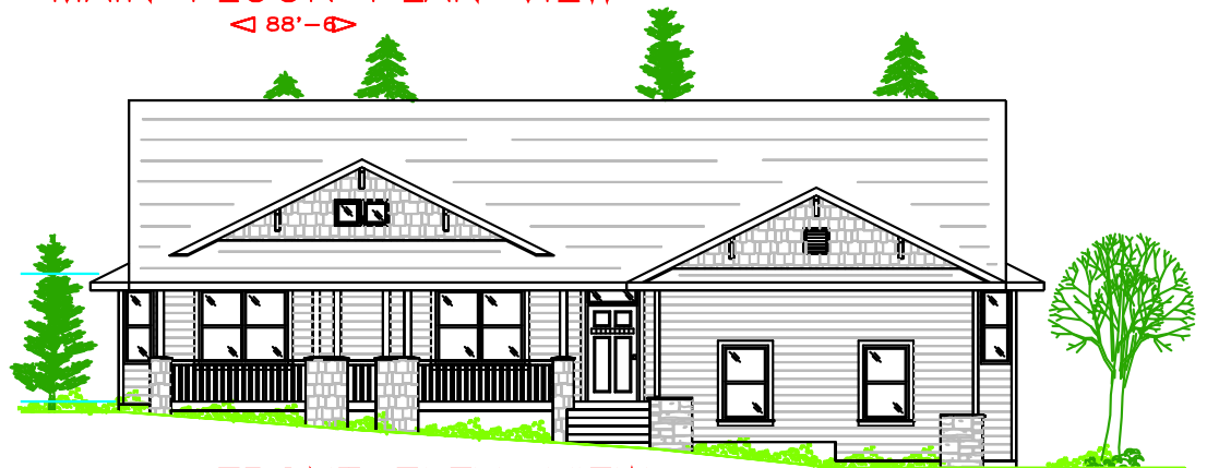
FRONT ELEV. VIEW

BRABEC DRAFTING SERVICE VANCOUVER, WA (360) 892-9502