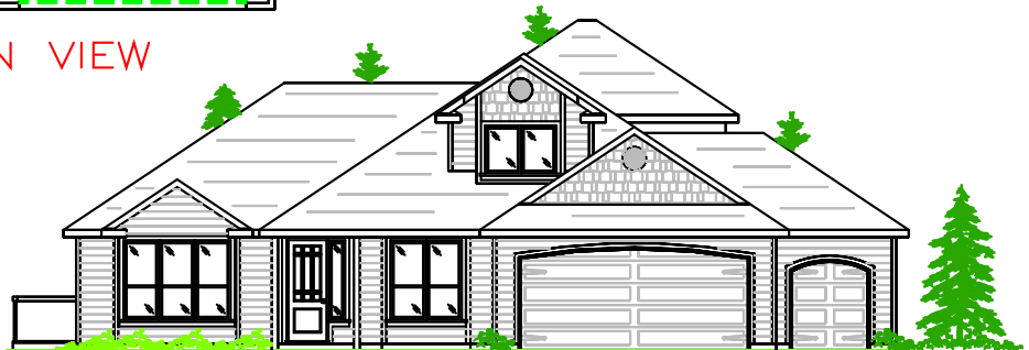
FRONT ELEV. VIEW

BRABEC DRAFTING SERVICE VANCOUVER, WA (360) 892-9502