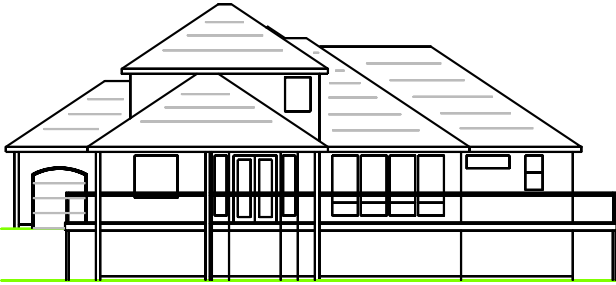
REAR ELEV. VIEW