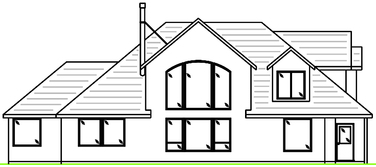
REAR ELEV. VIEW