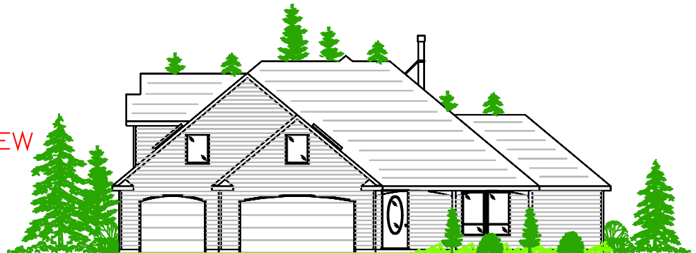
FRONT ELEV. VIEW

BRABEC DRAFTING SERVICE VANCOUVER, WA (360) 892-9502