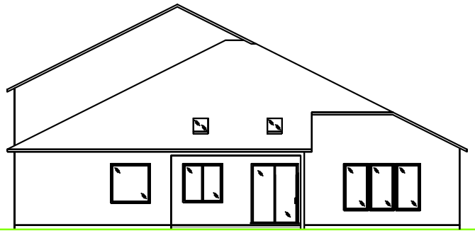
REAR ELEV. VIEW