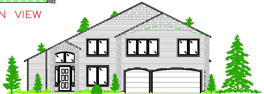
FRONT ELEV. VIEW

BRABEC DRAFTING SERVICE VANCOUVER, WA (360) 892-9502