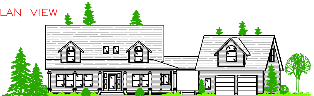
FRONT ELEV. VIEW

BRABEC DRAFTING SERVICE VANCOUVER, WA (360) 892-9502