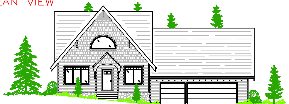
FRONT ELEV. VIEW

BRABEC DRAFTING SERVICE VANCOUVER, WA (360) 892-9502