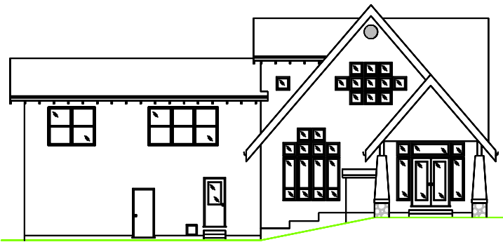
REAR ELEV. VIEW