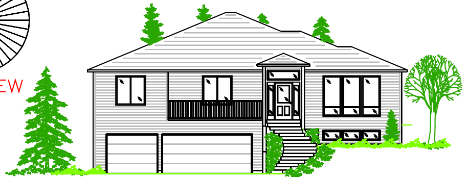
FRONT ELEV. VIEW

BRABEC DRAFTING SERVICE VANCOUVER, WA (360) 892-9502