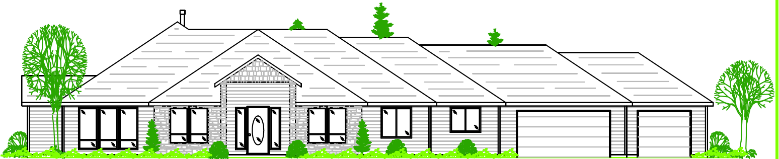
FRONT ELEV. VIEW

BRABEC DRAFTING SERVICE VANCOUVER, WA (360) 892-9502