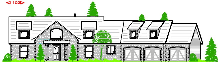
FRONT ELEV. VIEW

BRABEC DRAFTING SERVICE VANCOUVER, WA (360) 892-9502