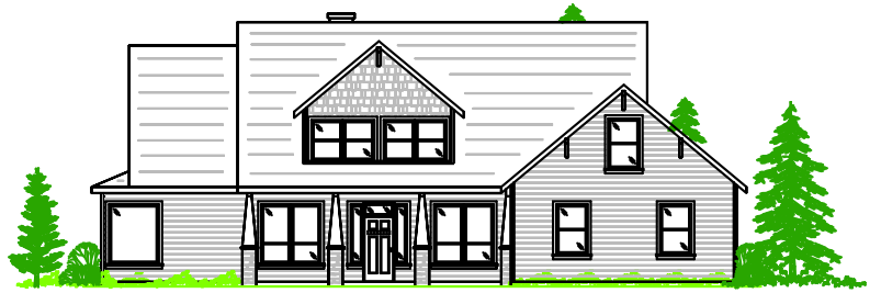
REAR ELEV. VIEW