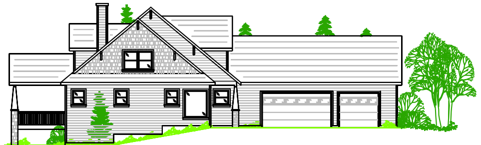
FRONT ELEV. VIEW

BRABEC DRAFTING SERVICE VANCOUVER, WA (360) 892-9502