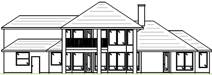
REAR ELEV. VIEW