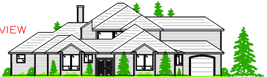
FRONT ELEV. VIEW

BRABEC DRAFTING SERVICE VANCOUVER, WA (360) 892-9502