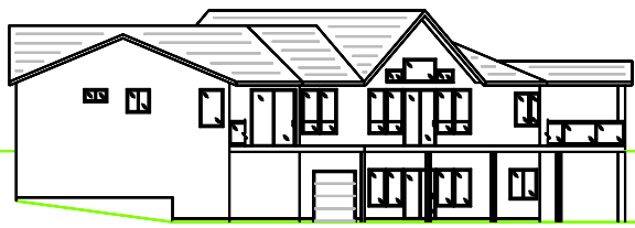
REAR ELEV. VIEW