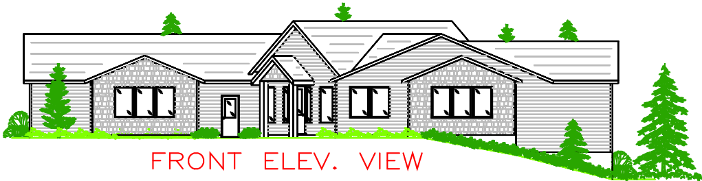
FRONT ELEV. VIEW

BRABEC DRAFTING SERVICE VANCOUVER, WA (360) 892-9502