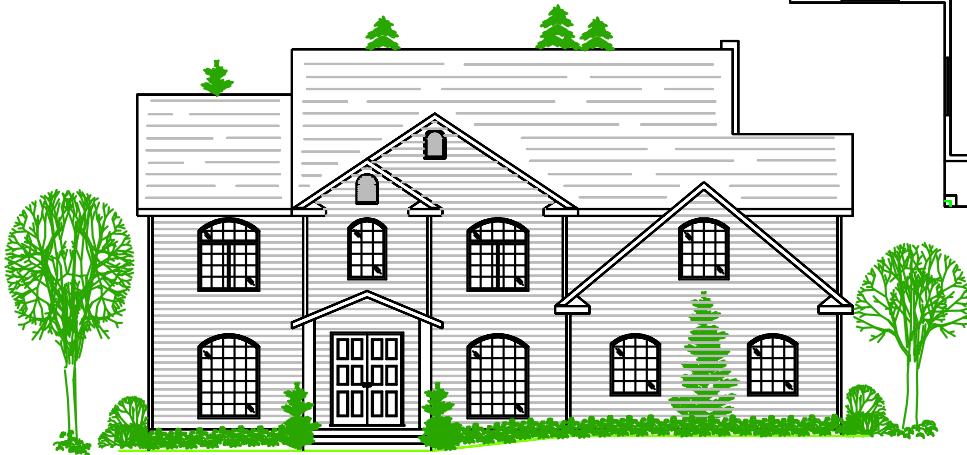
FRONT ELEV. VIEW

BRABEC DRAFTING SERVICE VANCOUVER, WA (360) 892-9502