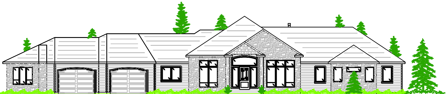
FRONT ELEV. VIEW

BRABEC DRAFTING SERVICE VANCOUVER, WA (360) 892-9502