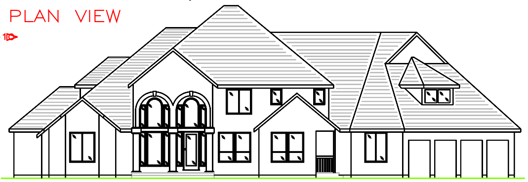
FRONT ELEV. VIEW

BRABEC DRAFTING SERVICE VANCOUVER, WA (360) 892-9502