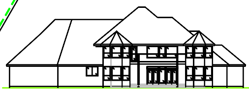
REAR ELEV. VIEW