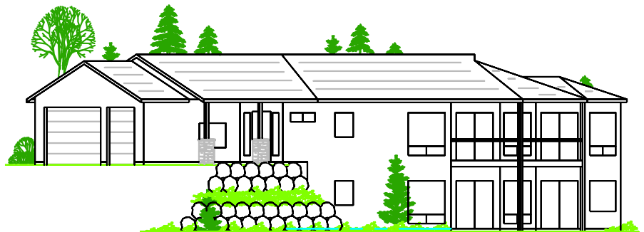
FRONT ELEV. VIEW

BRABEC DRAFTING SERVICE VANCOUVER, WA (360) 892-9502