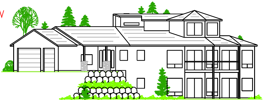
FRONT ELEV. VIEW

BRABEC DRAFTING SERVICE VANCOUVER, WA (360) 892-9502